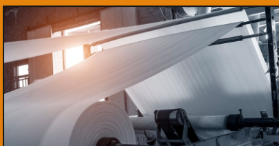
PAPER & PULP