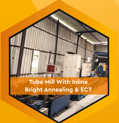
Tube Mill With Inline Bright Annealing & ECT